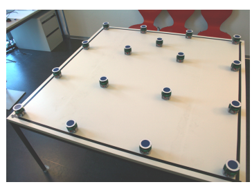
Figure 2: LEFT: The e-puck, a small-scale experimental robotic platform. Shown here with the radio communication board stacked between the basic module and the jumper board, allowing the implementation of sensor networks and other networked robotic systems. RIGHT: Several e-pucks in a table-top arena (Shown with colored markers attached to facilitate tracking by an overhead camera).

commands and data between the user and the physical devices. The Logic Layer is implemented using J2EE, which is a powerful, industrial development and production environment. The choice of J2EE was based on its reputation as a robust environment that supports industrial applications, and Web Services in particular.